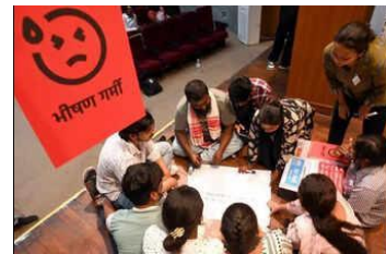
Gig workers design and distribute heat warning information. (Times of India)

ACORN India and the Gig Workers Association are demanding that India's Ministry of Labour and Employment app-based aggregators including Zomato, Swiggy, Blinkit, Zepto, Ola, Uber, Amazon: