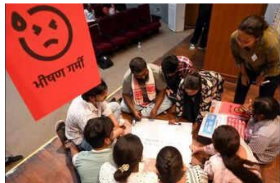
Gig workers design and distribute heat warning information.

VICTORY: ACORN-affiliated Gig Workers Association in collaboration with union and environmental allies have compelled the Indian Meteorological Service to make heat warnings accessible to workers in the informal sector – through community platforms, posters and handwritten notices at labour chowks. 39