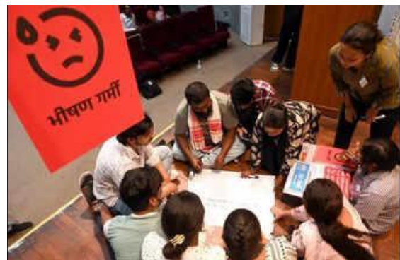
Gig workers design and distribute heat warning information.

VICTORY: ACORN-affiliated Gig Workers Association in collaboration with union and environmental allies have compelled the Indian Meteorological Service to make heat warnings accessible to workers in the informal sector – through community platforms, posters and handwritten notices at labour chowks. 39